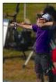
Jerome Bidault Rhino and Fury Bowstring Materials Diamondback and 1D Servings